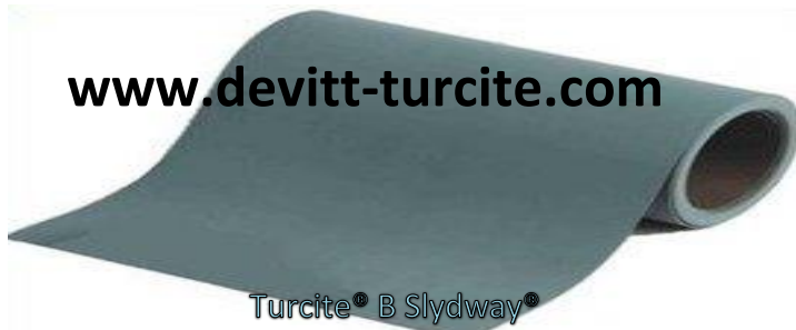
Turcite® B Slydway®

Is the traditional bearing material used on machine tool ways, transfer lines or any linear-movement application in which reduced friction & wear resistance are critical design considerations.